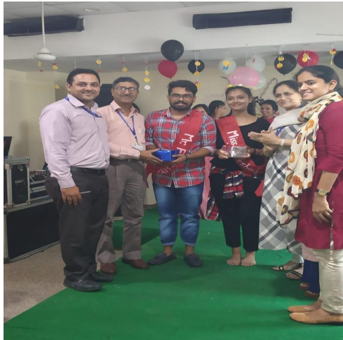
(Mr. and Ms. Fresher)