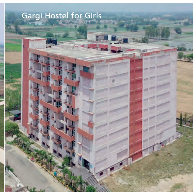
Gargi Hostel for Girls