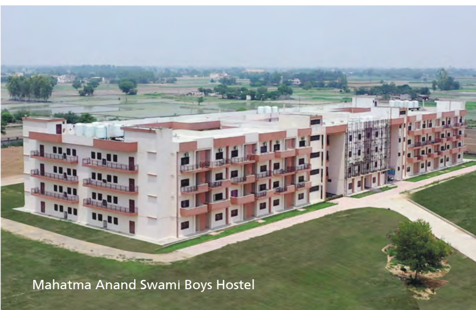
Mahatma Anand Swami Boys Hostel