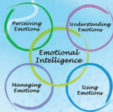
Emotional Intelligence Scale